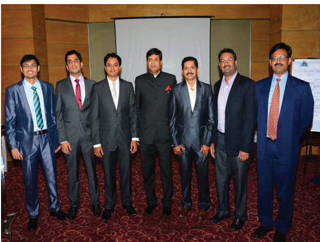
New Committee 2015 July - Dec