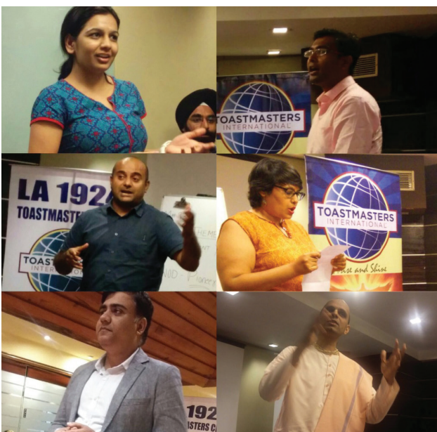
New members in action

to the family. Let's welcome with arms wide open our new and returning members: