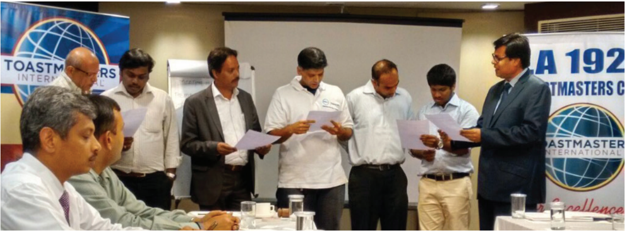
New members Installation ceremony